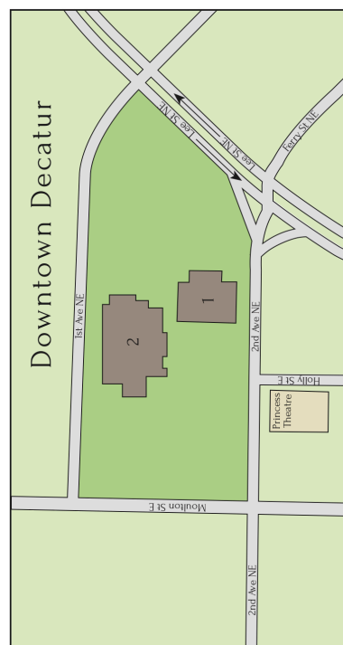
ALABAMA CENTER FOR THE ARTS - CAMPUS MAP