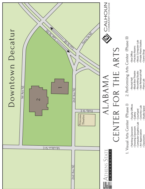
ALABAMA CENTER FOR THE ARTS - CAMPUS MAP