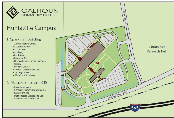
Huntsville Campus Map Download